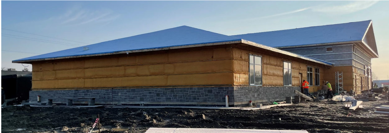
Brick Veneer Installation