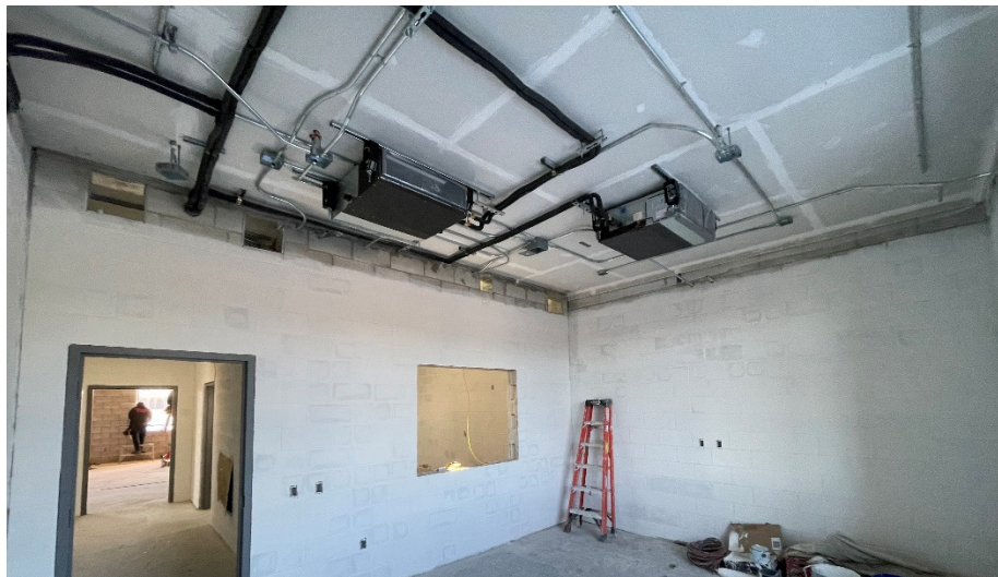
Kitchen – Primer, Mechanical & Electrical Equipment Installation