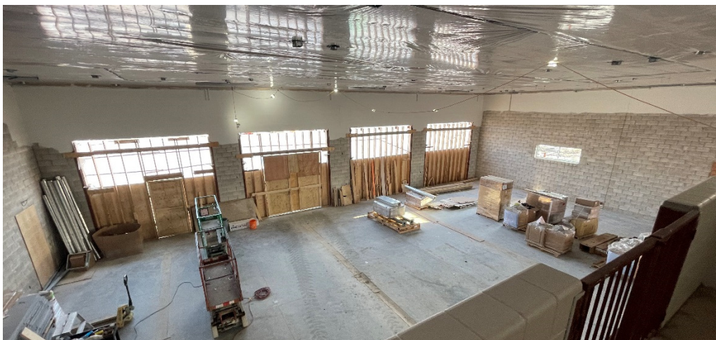
Apparatus Bay – Vapour Barrier Installed, Painting Commenced