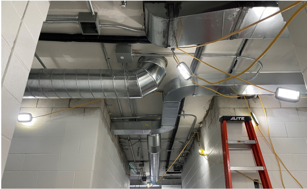
Corridor Ductwork Installed