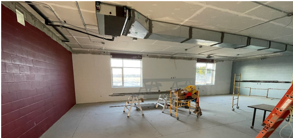
Training Room- Painted, Mechanical Equipment and Ductwork Installed