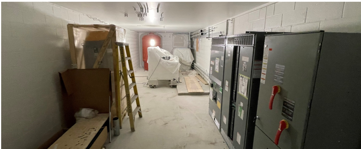
Mechanical Room- Painted, Switchgear installed