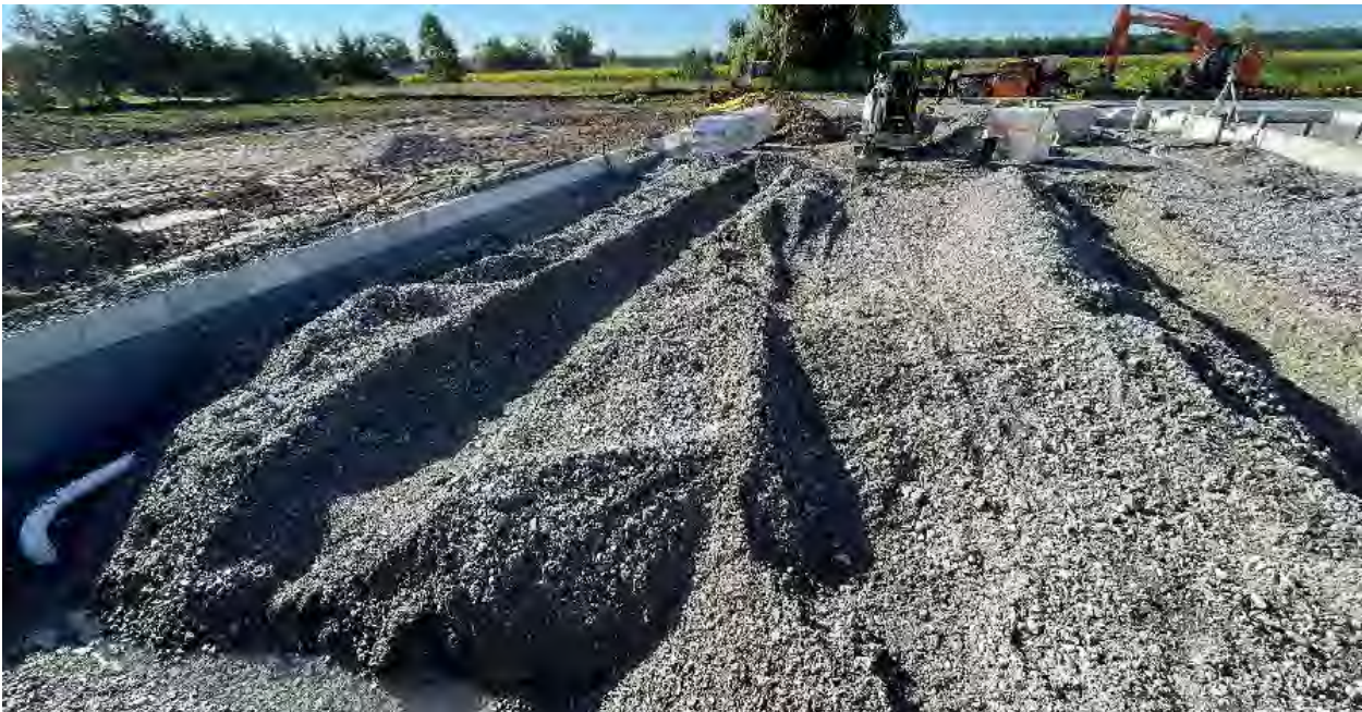
Excavation for Apparatus Bay Trench Drains