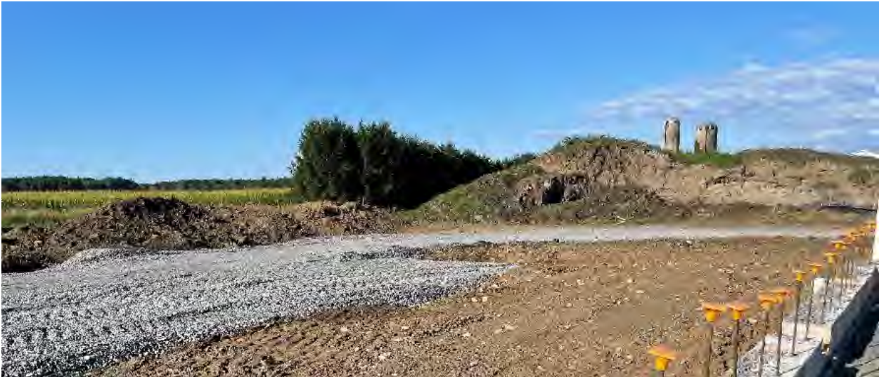
Roadway and Parking Lot Granular