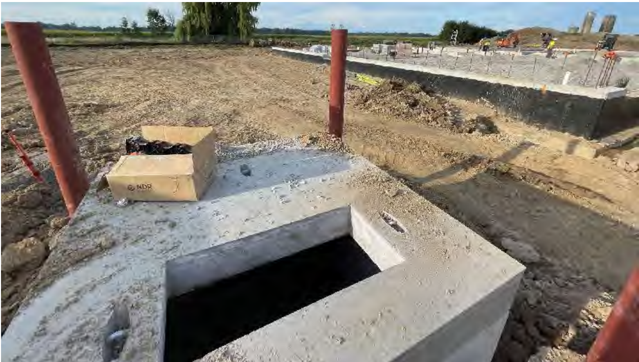
Transformer Electrical Vault Installed