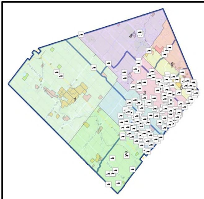
Figure 1: Location of properties investigated

Over 137 enforcement actions have been commenced because of these investigations. Depending on the severity of the By-law contraventions different enforcement actions were employed to seek compliance with the Town's By-laws. These enforcement actions